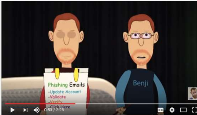
E-Safe: Phishing Emails - A Cartoon Short About The Dangers Of Phishing Emails